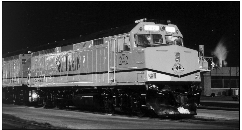
The Rio Grande gold and silver Prospector scheme has been applied to the Ski Train power! This gives the train a uniform appearance. Amtrak F40’s 242, 283 and 289 were photographed early on 12/17/00 at Denver Union Station.